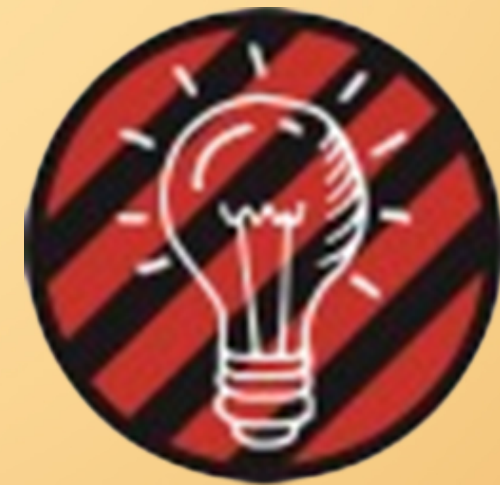
High sensory area warning