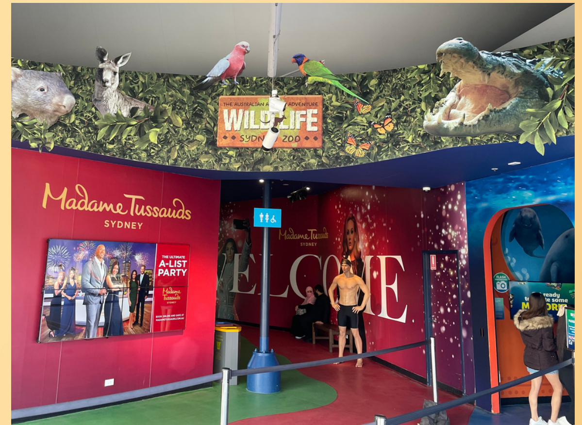
WILDLIFE Zoo entry